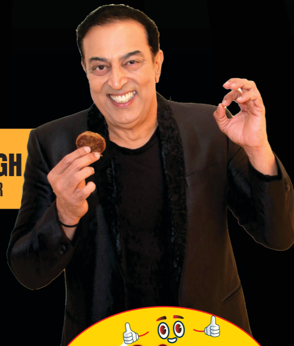
VINDU DARA SINGH BRAND AMBASSADOR